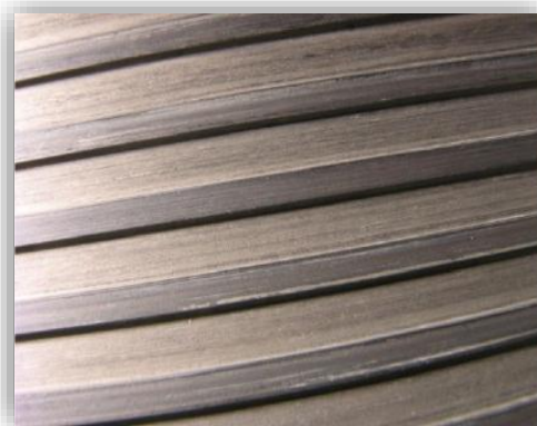
Gun Barrel 066 after Automatic Cleaning System was applied (12 Cycles)