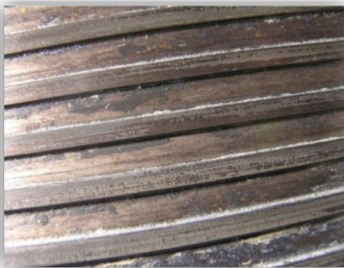
Gun Barrel 066 after manual cleaning method was applied (24 Cycles)